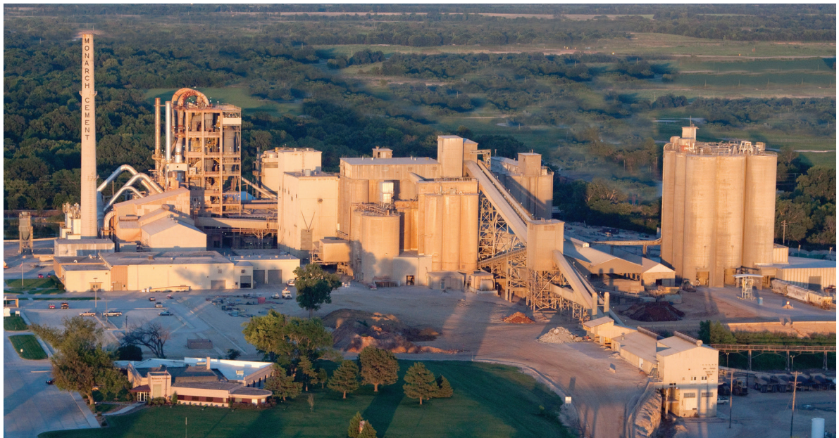
Monarch Cement Company's plant in Humboldt, Kansas