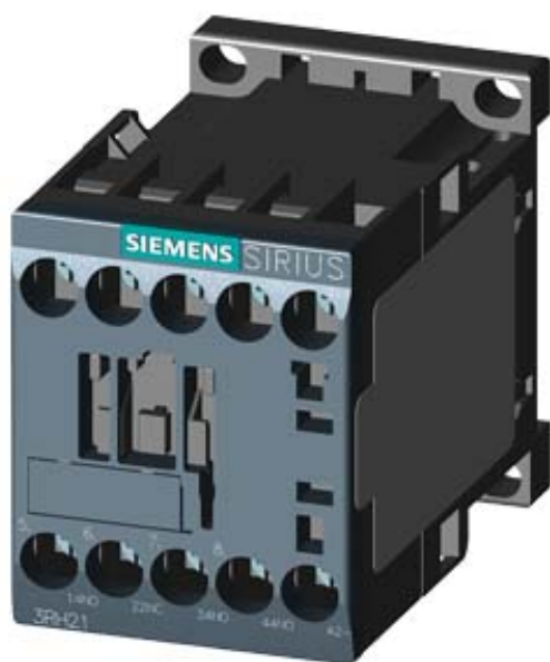
CONTACTOR RELAY, 3NO+1NC, DC 24V, SIZE S00, SCREW TERMINAL